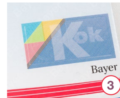
Safety features of Kovaltry®-packaging (further variants might be available)