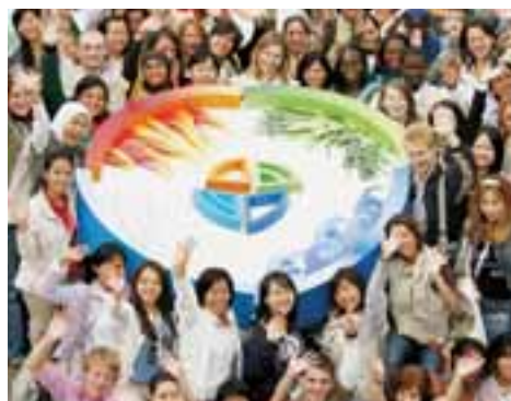
The conference attendees were impressed by the new Tunza logo symbolizing the four elements.