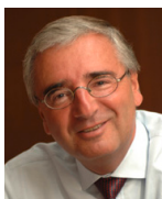
DR. OEC. HSG. PAUL ACHLEITNER

born on September 28, 1956 in Linz, Austria