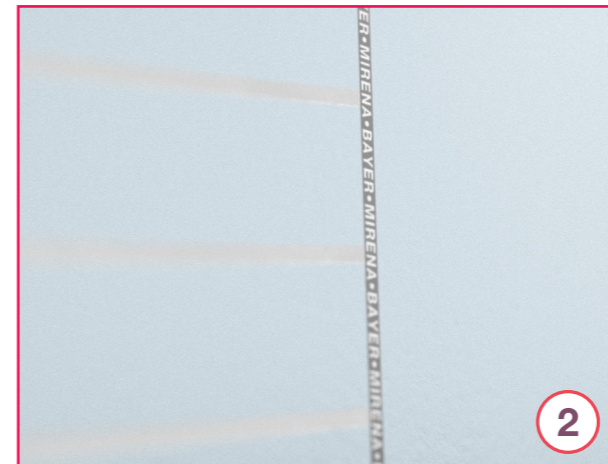
Safety features of Mirena®-packaging (further variants might be available)