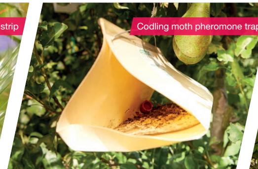
Codling moth pheromone trap