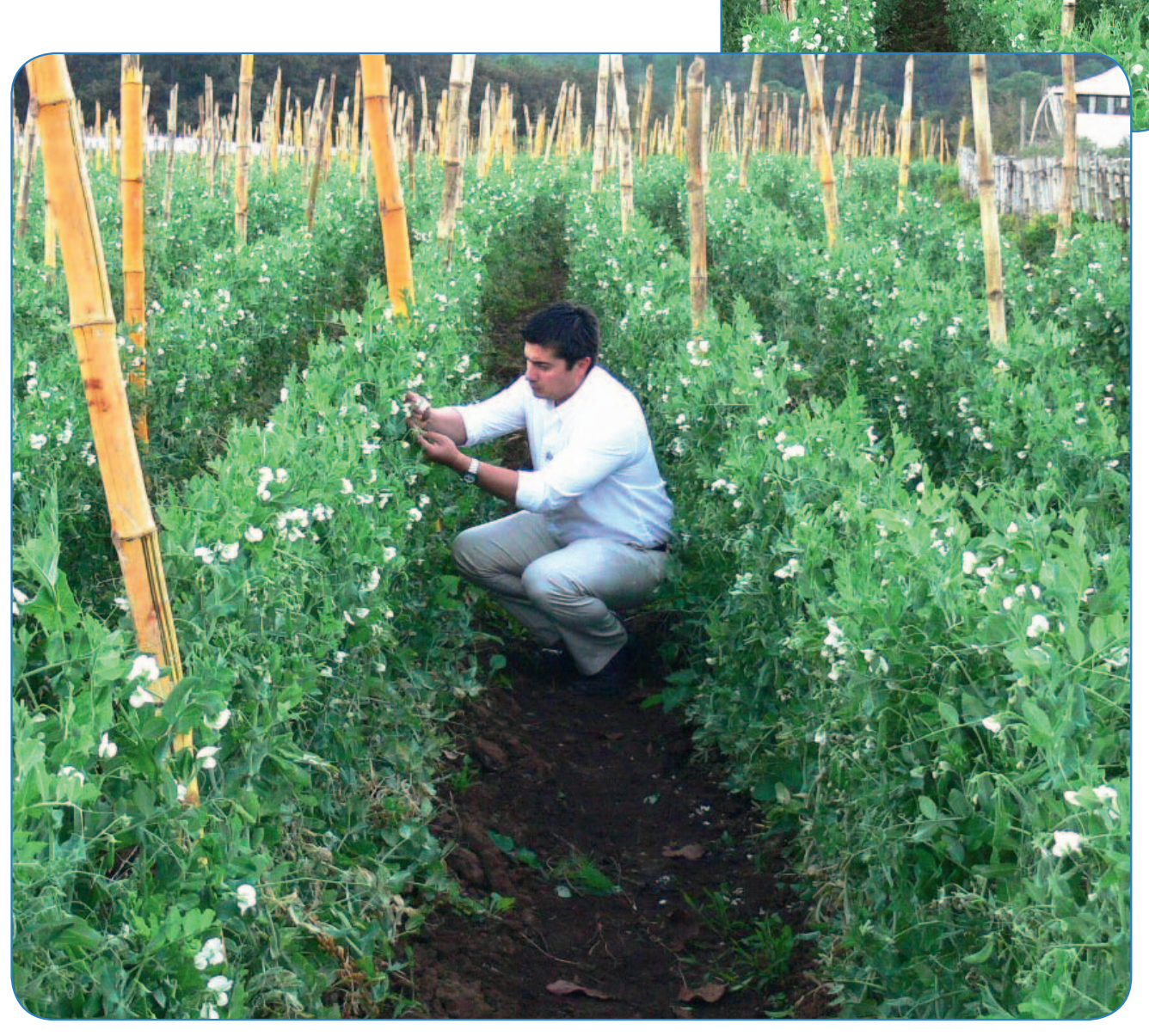
San Juan Agroexport, Km 29.5 highway to San Raimundo, Guatemala

At Bayer CropScience we want to be our customers' preferred partner through offering integral solutions that combine our experience with the know-how of producers, agro-exporters and retailers to achieve two goals: first, to guarantee the quantity, quality and safety of the produce to consumers; and second, to provide benefits that differentiate Guatemalan produce and deliver a perceived added value.